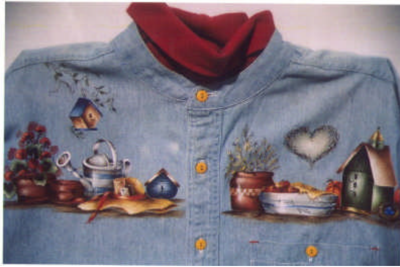
Acrylic on Denim