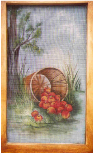
Acrylic on a screen